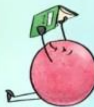
Reading Under a Tree