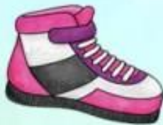
Taking a Walk