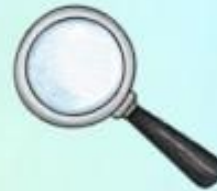
Going on a Scavenger Hunt